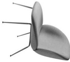
Lounge chairs. Beerta Lounge GUBI

If you need more furniture for your studio, take a look at this list and contact Service Center at hello@epicenterstockholm.com