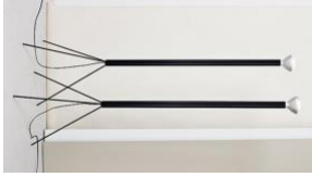
Floor lamp Luminator Fos