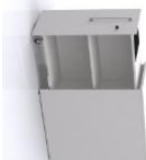
Storage drawers Neat - Tower Studio - White Partnerdesk - Black