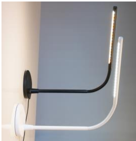
Work lamp LED Kondator Black