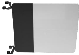
Whiteboards on wheels. Black legs, black textile, white drawboard. Lintex - Wood