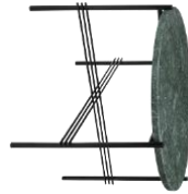
Coffee table. Gamratas/ GUBI Green Marble