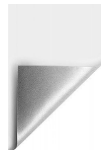
Movable whiteboards on walls. Whiteboard